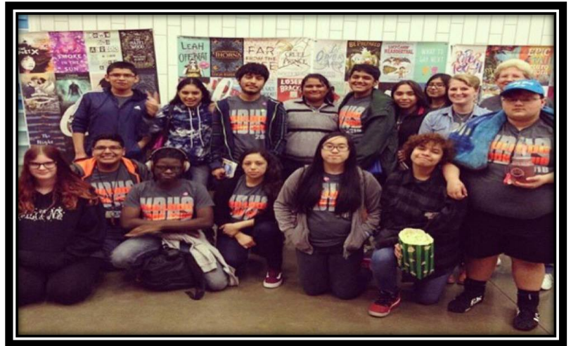
2018 Teen Book Club Participants NDBSL Sponsored Field Trip

NDBSL BOARD MEETING SATURDAY MAY 12 NDHS LIBRARY 10-12 PM ALL MEMBERS ARE WELCOME!